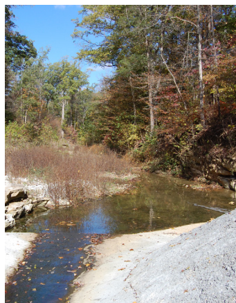
CREEK FACING DOWNSTREAM FROM SPRING 018