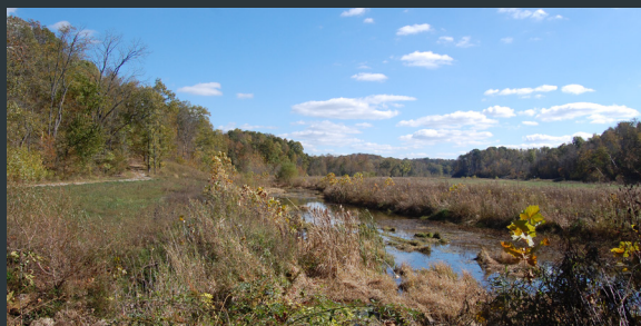
RESTORATION EAST OF PEERLESS ROAD

The Construction Certification Report for Bailey's Branch Creek and Tributary 3 Concrete Sealing, completed as part of the Spring 018 Interim Measure, was submitted to U.S. EPA on February 20, 2014. Water from the spring continued to be treated and discharged until June 19, 2013. At that time, with approval from the U.S. EPA and the Indiana Department of Environmental Management (IDEM) based on favorable testing results, the treatment system for the spring water was placed into standby mode, with ongoing spring water monitoring to ensure PCB concentrations did not increase above acceptable levels. A memo outlining a contingency plan for re-starting the collection and