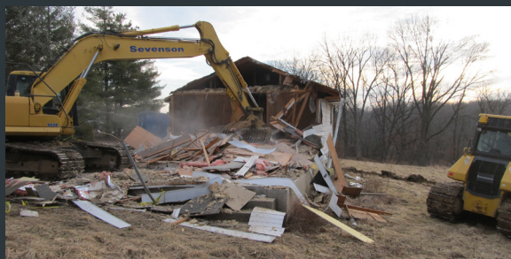
BARLOW LANE HOUSE DEMOLITION