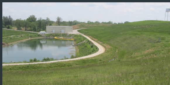
COMPLETED COVER WORK AROUND THE STORM WATER POND