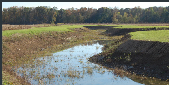
RESTORATION WEST OF PEERLESS ROAD