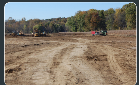
PARCEL 40 RESTORATION AND HARVESTING