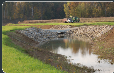
PLEASANT RUN CROSSING