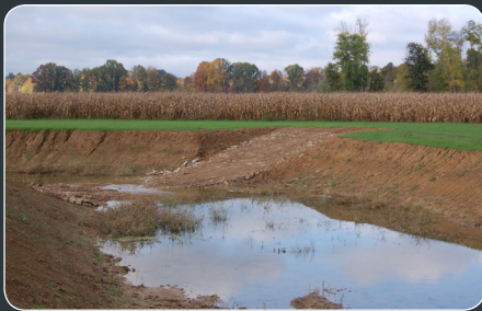
PLEASANT RUN LOW-FLOW CROSSING

Work continued on the design and finalizing of the alignment of the perimeter groundwater collection trench, which will be installed along the downgradient (north and east) side of the East Plant Area. GM has acquired all properties on Barlow Lane (immediately east of the Plant) where the proposed groundwater collection trench will be installed. A motion was put before and approved by Bedford City Council to vacate Barlow Lane in advance of trench installation activities.