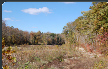
FACING DOWNSTREAM AT RESTORATION FROM BROOMSAGE ROAD