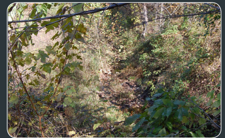
FACING DOWNSTREAM AT RESTORATION FROM BAILEY SCALES ROAD