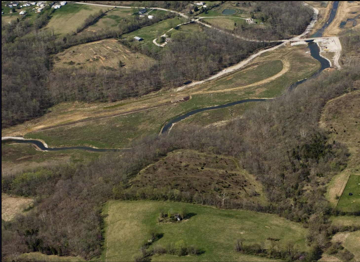
Restoration east of Peerless Road

G M C E T C B E D F O R D F A C I L I T Y , B E D F O R D , I N D I A N A