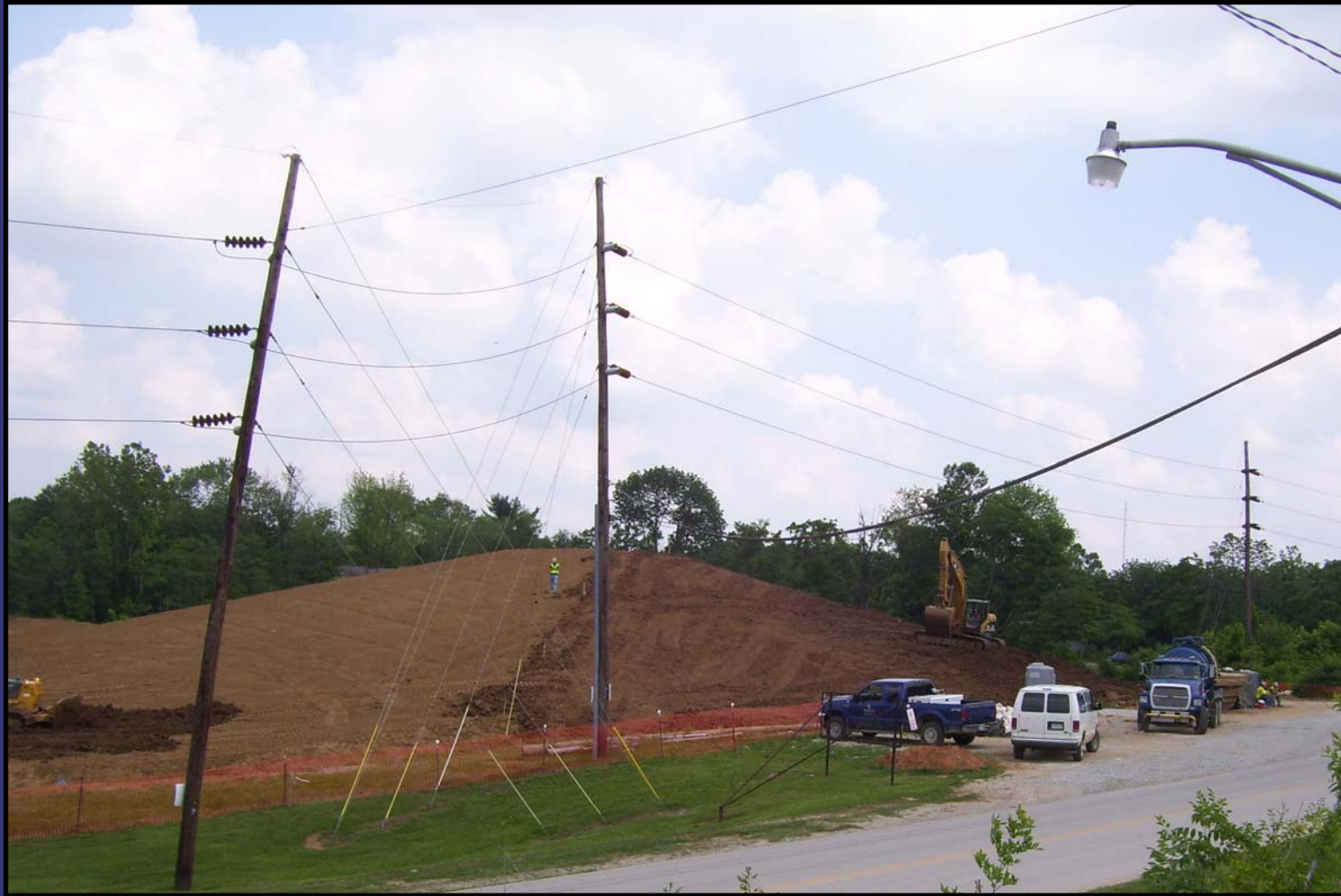
Parcel 201 clay placement off of GM Drive. Small amount of grading seeding remains.