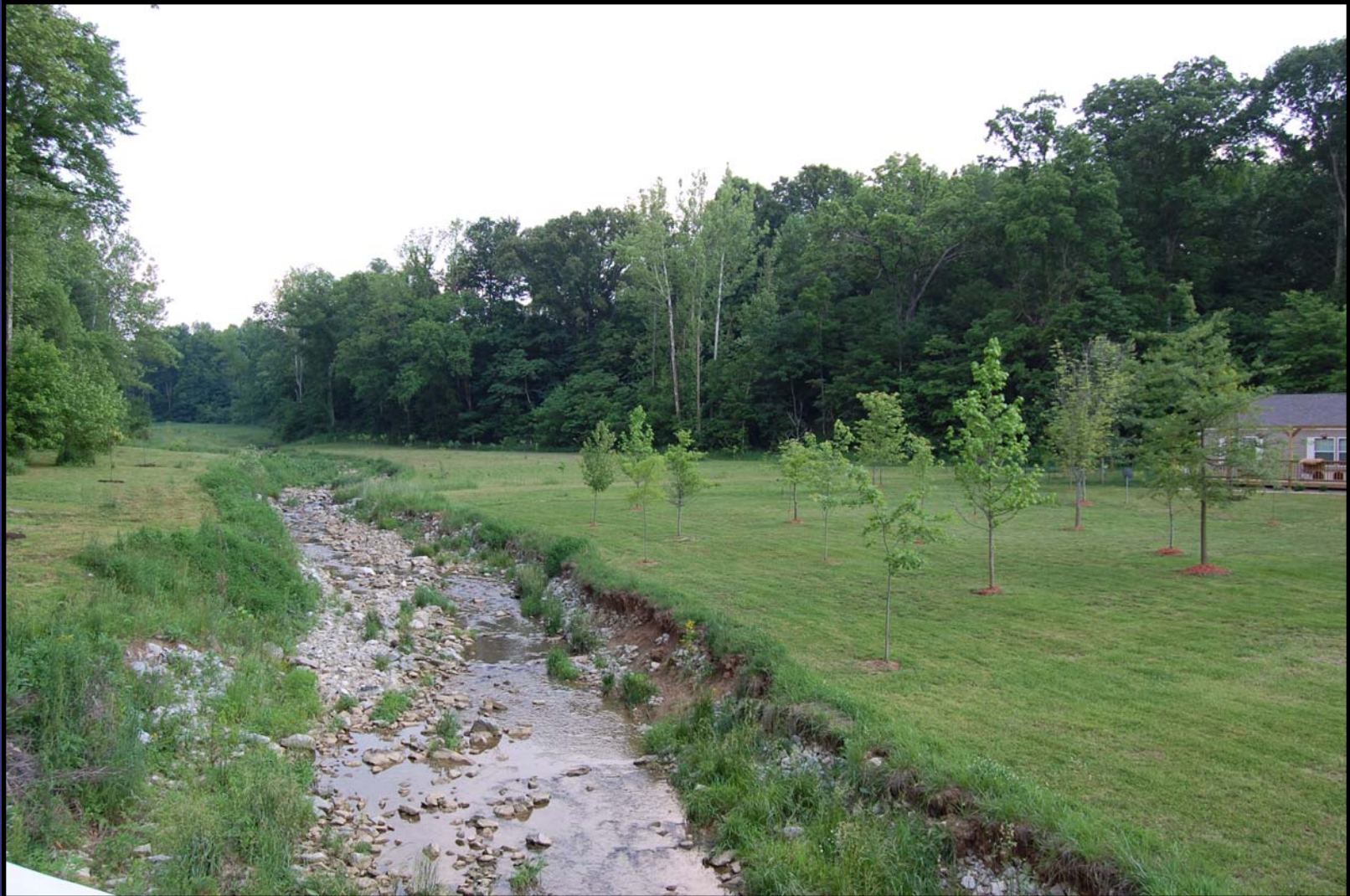
Looking south from Broomsage Road

GM CETC BEDFORD FACILITY, BEDFORD, INDIANA