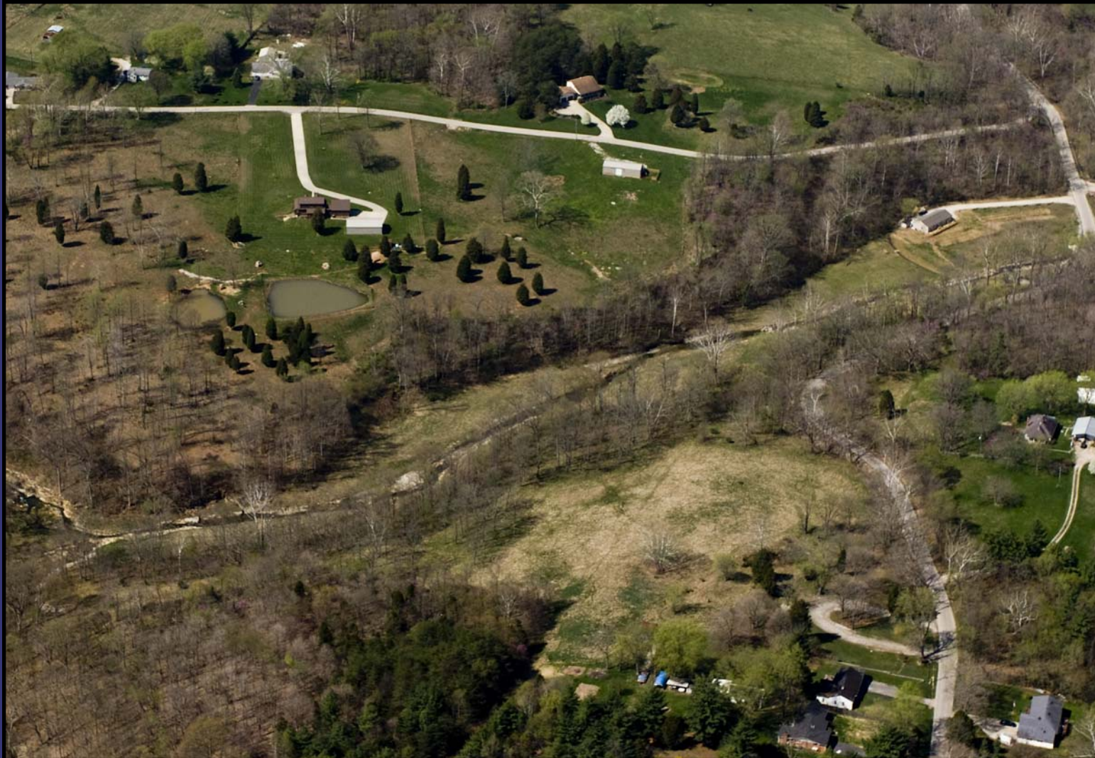
South of Broomsage Road Restoration

G M C E T C B E D F O R D F A C I L I T Y , B E D F O R D , I N D I A N A