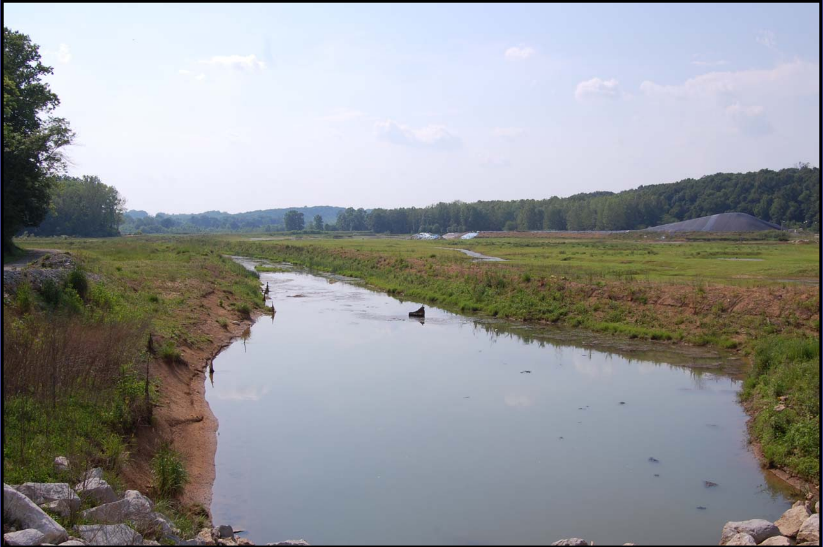
West of Peerless Road

G M C E T C B E D F O R D F A C I L I T Y , B E D F O R D , I N D I A N A