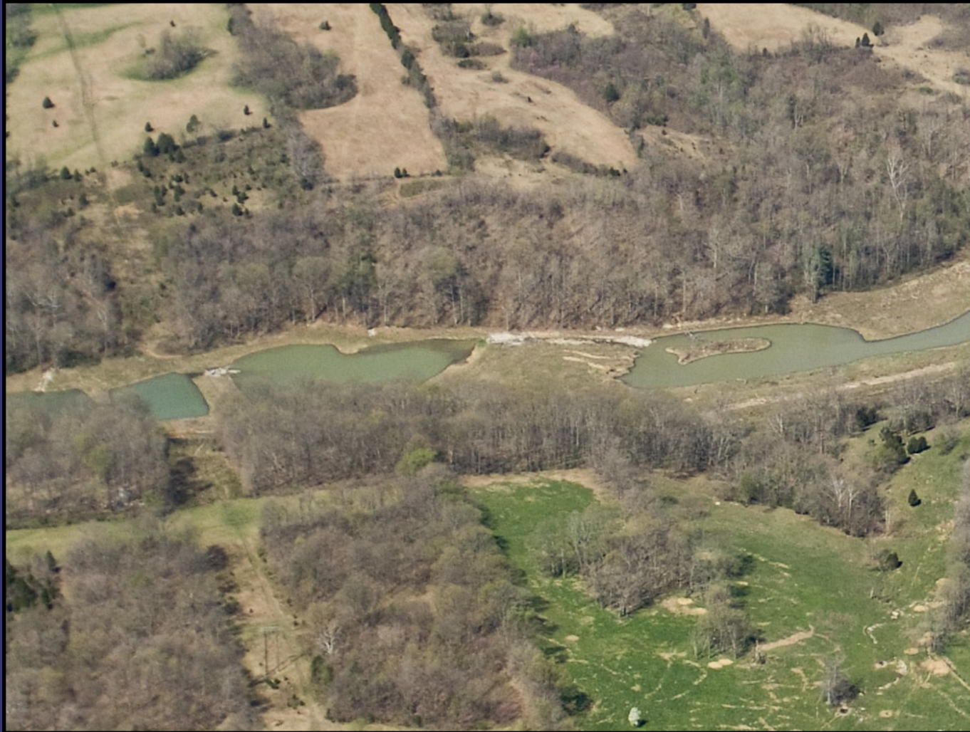
Restoration North of Broomsage Road

G M C E T C B E D F O R D F A C I L I T Y , B E D F O R D , I N D I A N A