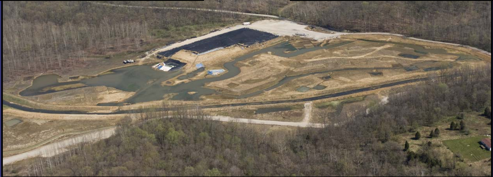
Excavation and soil pile remaining west of Peerless Road