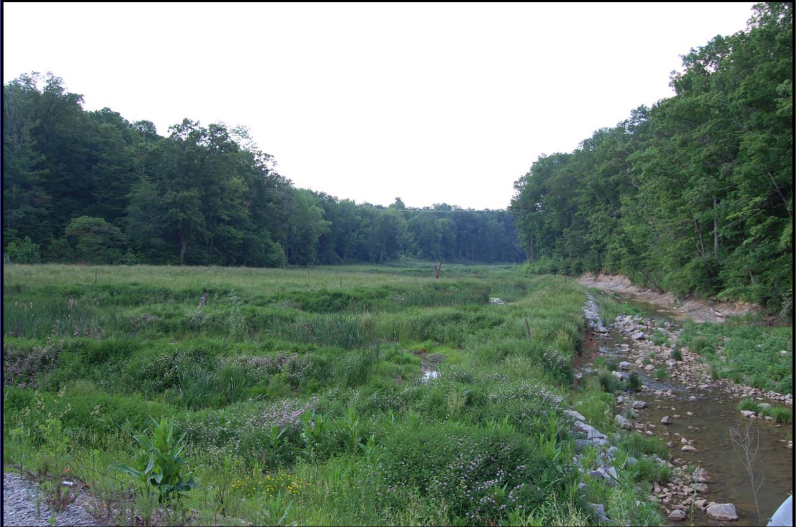
Looking north of Broomsage Road restoration

G M C E T C B E D F O R D F A C I L I T Y , B E D F O R D , I N D I A N A