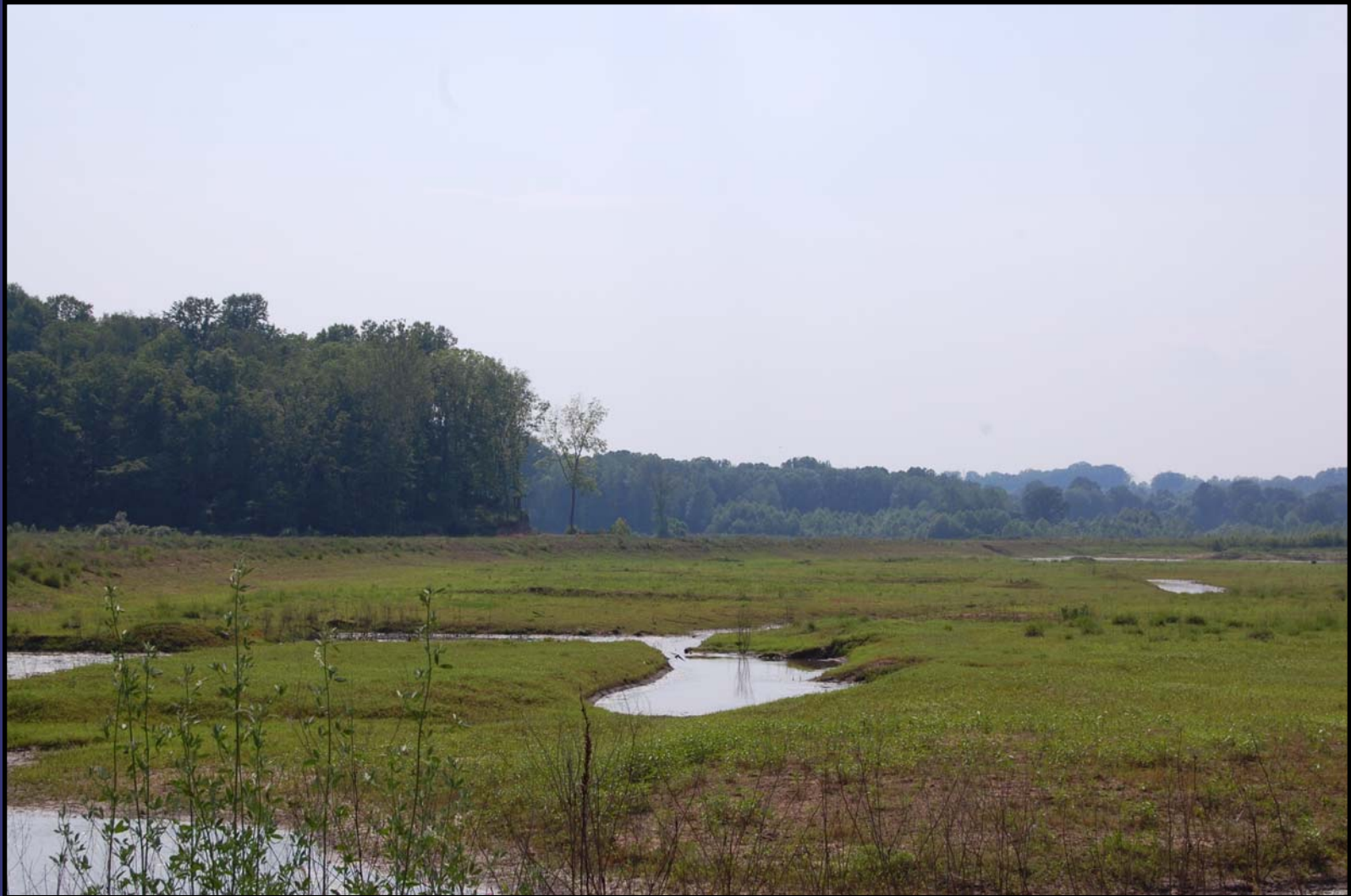
Restoration west of Peerless Road

G M C E T C B E D F O R D F A C I L I T Y , B E D F O R D , I N D I A N A