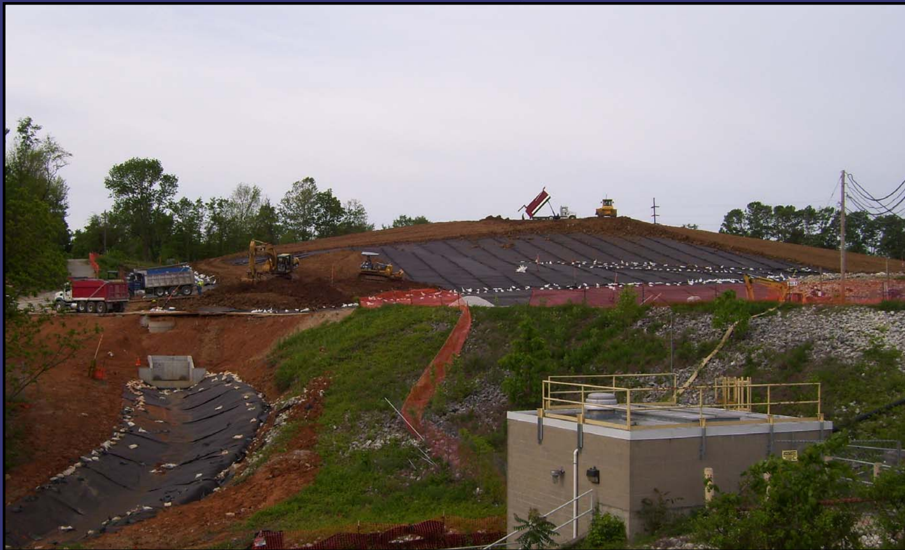
Placing clay over the impermeable liner at Parcel 201

G M C E T C B E D F O R D F A C I L I T Y , B E D F O R D , I N D I A N A