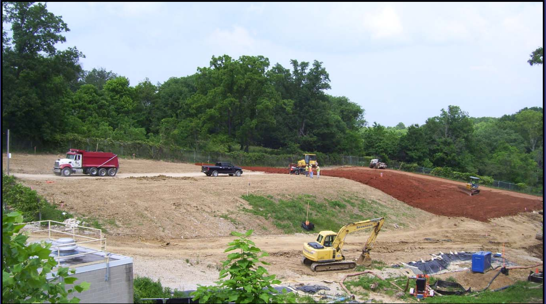
Clay grading completed northeast of Parcel 201.

GM CETC BEDFORD FACILITY, BEDFORD, INDIANA