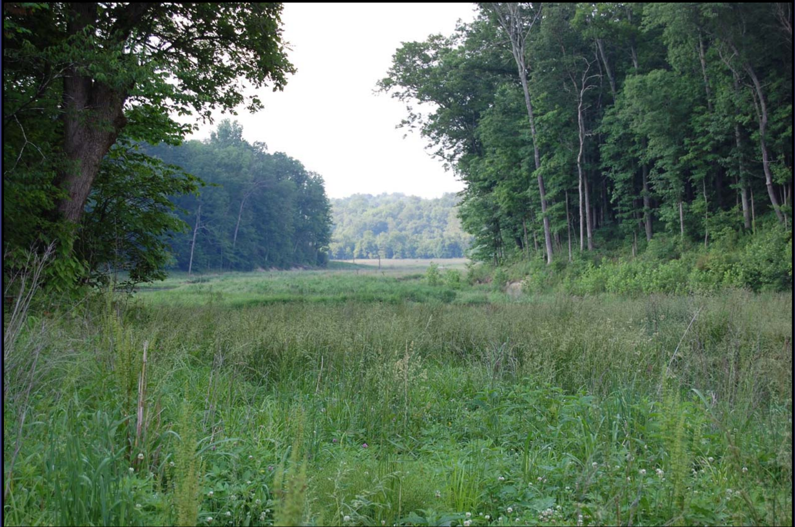
Restoration north of Broomsage Road

G M C E T C B E D F O R D F A C I L I T Y , B E D F O R D , I N D I A N A