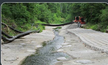
WATER FLOWING THROUGH SEALED CREEK AT SPRING 018