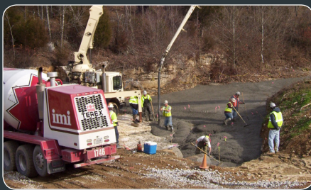
CONCRETE PUMPER TRUCK AT SPRING 018

Work continued on finalizing the alignment of the perimeter groundwater collection trench, which will be installed along the downgradient (north and east) side of the East Plant Area. The proposed alignment of the trench is being reviewed by U.S. EPA, including new drilling logs and downhole geophysical testing results submitted in May 2013 from along the new alignment. (This trench will collect groundwater from the East Plant Area before it leaves the Plant property, for treatment prior to discharge.)