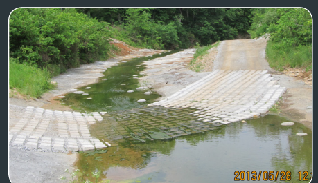
FACING DOWNSTREAM ON BAILEY SCALES BRANCH CREEK UPSTREAM OF SPRING 018