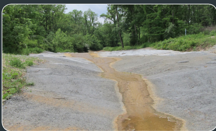
FACING UPSTREAM AT SEALED TRIBUTARY 3