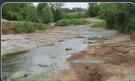
FACING UPSTREAM ON BAILEY SCALES BRANCH CREEK UPSTREAM OF SPRING 018