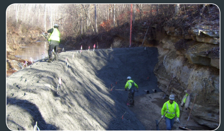
CONCRETE POURING OVER SPRING 018 BERM